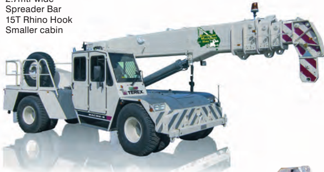
35T Pick & Carry Crane: