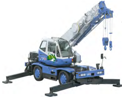
Maeda MC305C-2 Mini Crawler Crane