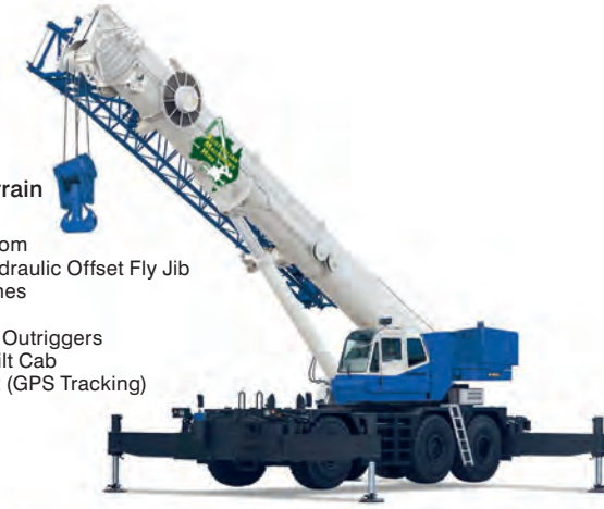
145T Rough Terrain Crane: